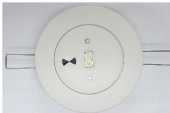
LED Head with Adapter Ring